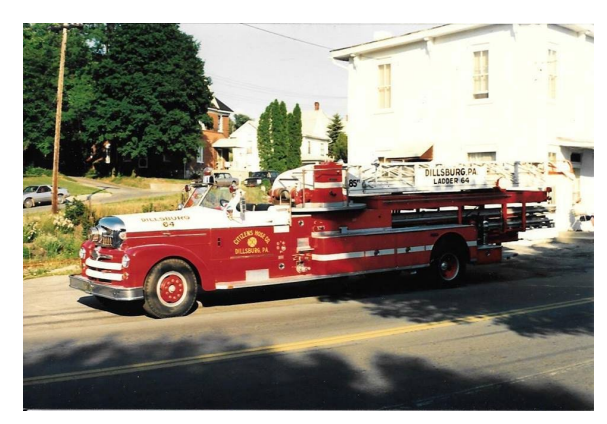
Figure 1- Dillsburg's Seagrave ladder truck, Ladder 64

Some randomly selected images of ladder trucks that were formerly in service in York County fire companies.