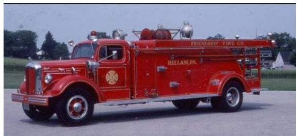
Figure 3- Hallam's Mack ladder truck, Ladder 21

A rarity, a city service ladder truck in service in York County