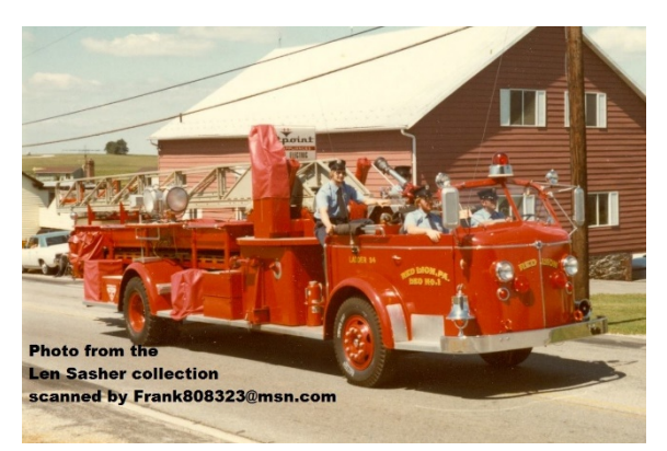
Figure 4-Red Lion's American LaFrance ladder t Ladder 34. Formerly York City Ladder B