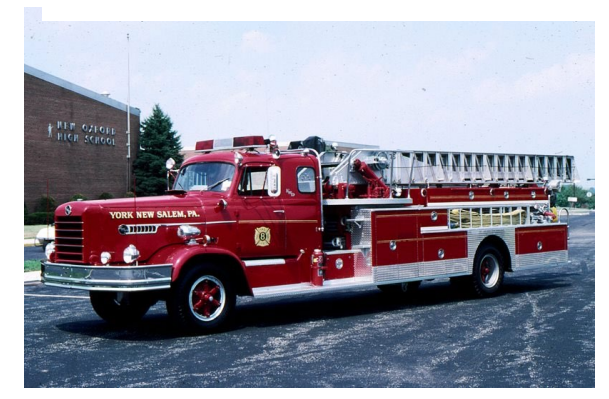
Figure 6-York New Salem's Pirsch ladder truck, Ladder 8