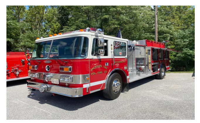
Figure 2 - Charles Riley's 1988 Pierce Arrow