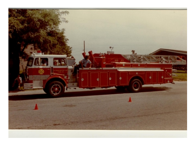
Figure 5-Shiloh's Hahn lader truck, Ladder 2

A rarity, a city service ladder truck in service in York County