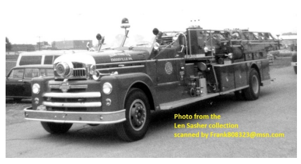
Figure 2- Emigsville's Seagrave ladder truck, Ladder 24